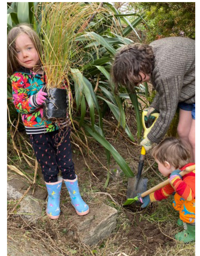
Stream team members are focused on riparian planting to help improve water quality.

The long term goal is that through these relationships with the stream, the children will become the next generation of kaitiaki.