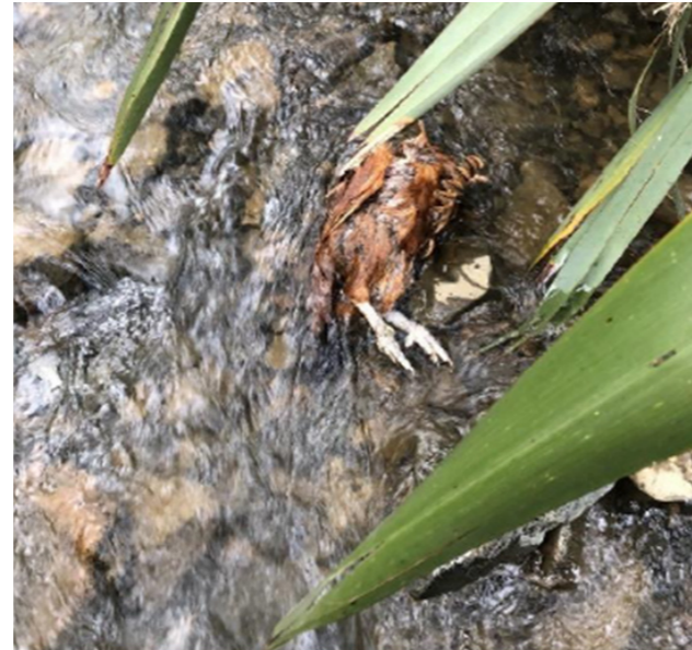
There have been dead fowl and chickens found in the stream posing a risk of contamination.

This is not Wellington Water's area of expertise, so we sought advice from Wellington City Council's Open Space and Parks Manager. The Council's Park Ranger team has now been onsite working and is supporting members of the community garden to find solutions to reduce the contaminations issues. These included managing run-off into the stream and the wildlife on site.