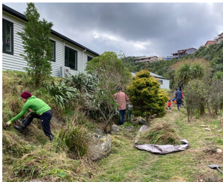
The Stream Team getting to work with their restoration efforts.