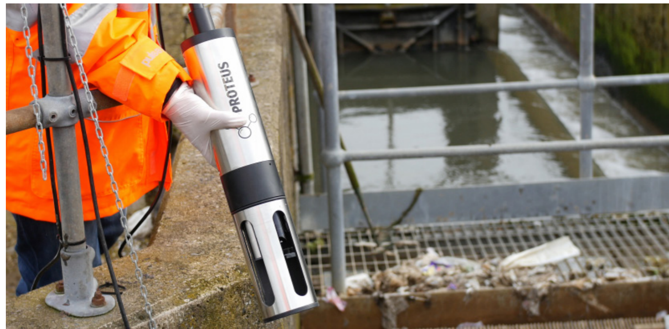
The Proteus Probe will allow us to monitor various water quality parameters in real time.

All data from the Proteus Probe can be sent straight through to any web-based dashboard or mobile device. Results and data from the trial will also be shared with residents through the association's technical leads.